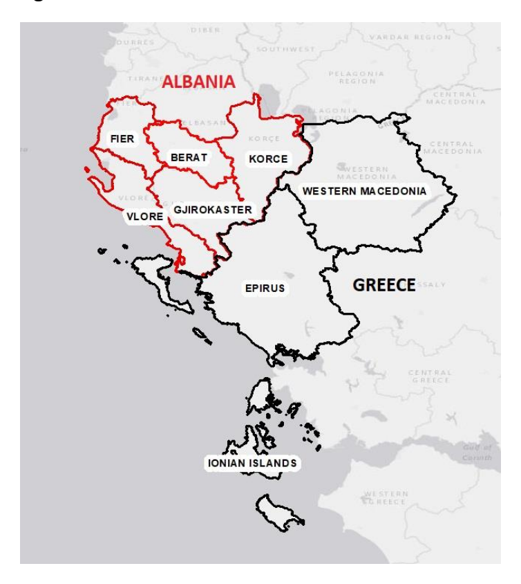
Figure 4-1: Map of the programme area

The Programme Area is part of the wider region of the Adriatic-Ionian, spreading from the Ionian Islands in Greece up to the coasts of the Region of Fier in Albania. On the Greek mainland the Programme area includes the whole Region of Epirus and the Region of Western Macedonia, including the land borders with Albania, from Mavromati-Qafë Botë to Krystallopigi-Kapshticë, while in the insular part it includes the Region of Ionian Islands. The Albanian Programme Area on the west side spreads from the Region of Vlorë up to the Region of Fier and on the east side from the Region of Gjirokastër up to the Regions of Berat and Korçë. The eligiblle programme areas in Albania include: the Region of Berat, the Region of Gjirokastër, the Region of Korcë, the Region of Vlorë and the Region of Fier.